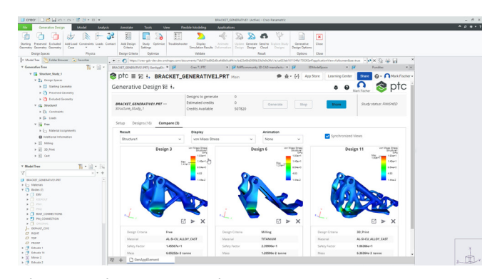
Alternative designs to consider

Creo is the 3D CAD solution that helps you accelerate product innovation so you can build better products faster. Easy-to-learn Creo seamlessly takes you from the earliest phases of product design to manufacturing and beyond. You can combine powerful, proven functionality with new technologies such as generative design, augmented reality, real-time simulation, additive manufacturing and the IoT, to iterate faster, reduce costs and improve product quality. The world of product development moves quickly, and only Creo delivers the transformative tools you need to build competitive advantage and gain market share.