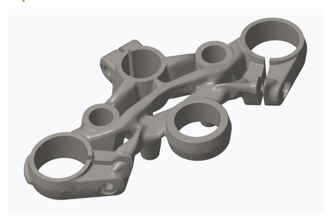
A converged solution that leverages a parting line constraint to support a casting manufacturing process.